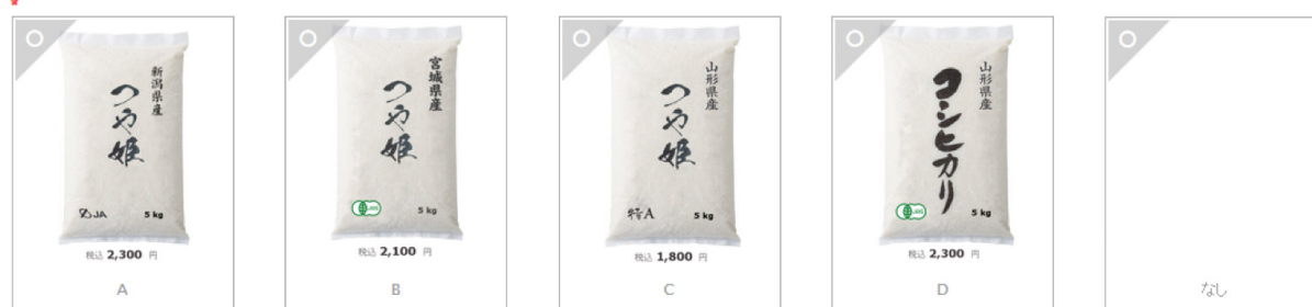
Figure 3 Choice set 1 of 9 with choices A to D and no-choice option