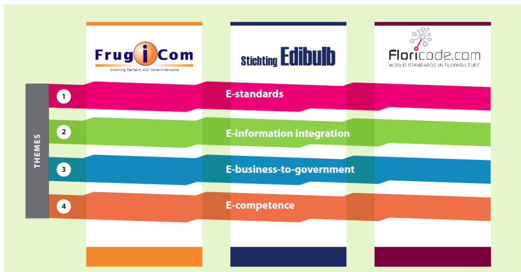
Figure 2. Focus areas of the Digital Greenport Holland

The activities of Digital Greenport Holland focus on four main themes (see Figure 2): information standards (E-standards), information integration within and between businesses in chains and networks (E-information-integration), information exchange between companies and governments (E-business-to-government) and increasing awareness, knowledge and skills on digital information management (E-competence).