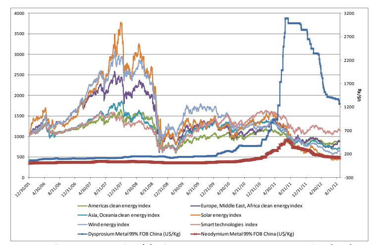
Figure 2. Trend of REM prices (in $/Kg) and clean energy indexes (12/30/2005=1000)

Visual inspection of the data (figure 2) indicates that generally clean energy indexes move with the same trend reaching very high peaks during the end of 2007 and dramatically falling within one year. During 2008-2009 these indexes remain constant or weakly grow until the end of 2010 and drop again during mid-2011. As far as rare material, prices begin to show an increasing trend in the middle of 2009, with a strong soar from beginning 2011. Dysprosium and Neodymium increased until 808% and 436% respectively and after August 2011 prices fall but without reaching the levels before the surge. REMs price increase is mainly due to the above mentioned China cut domestic output and reduced export quotas, while the subsequent price reduction is mainly driven by weak economic growth in the major rare earth consuming nations, slow growth in China, which along with being the world's largest producer of rare earths, is also the largest consumer.