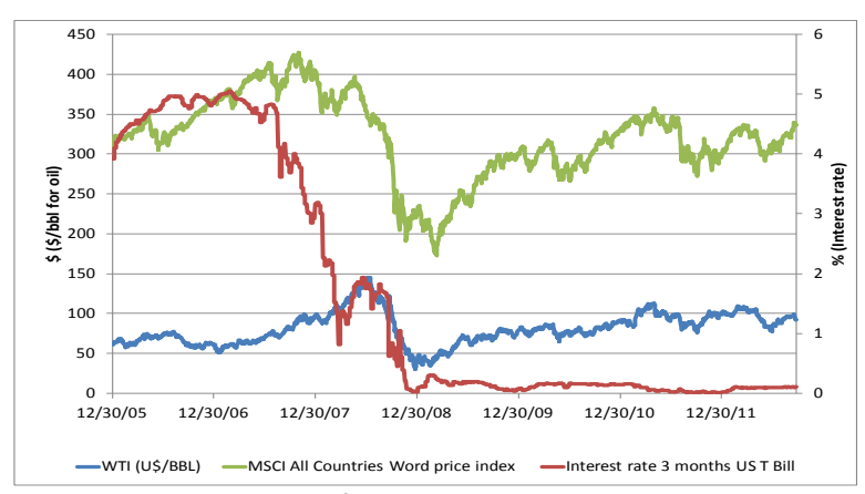
Figure 3. Trend of Oil price, interest rate and MSCI

Figure 3 reports the trend of the other variables used in the model, and shows the dramatic reduction in stock market indices and interest rates in the period just following the bursting of the 2007 financial bubble.