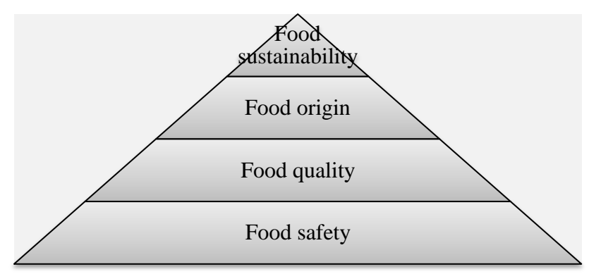
Figure 3. Hierarchy of transparency domains

Food safety is considered to be the most fundamental level of transparency because food chain members and consumers are increasingly concerned about food incidents (Beulens, Broens et al. 2005). In other words, if food is not safe to eat and consequently causes illness, transparency for the superior levels is redundant. After food safety transparency is fulfilled, food quality (e.g. sensory attributes) can be assured which forms the second level. If consumers and food chain members have reached transparency in food safety and quality, knowledge about food origin gains interest. Food origin can be seen as an enlargement of food quality, where not only the composition of food is transparency is food sustainability, whereas a distinction can be made between environmental (e.g. food miles), social (e.g. fair trade) and economic issues (e.g. price transparency).