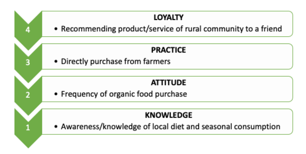
Figure 1. integrated model to measure the level of sustainable urban consumer behavior.

Section 1 of the survey measured urban consumers' purchasing behavior (SUCB) with the Knowledge, Attitude, Practice, Loyalty model. Respondents were asked about their awareness/knowledge of local diets and seasonal consumption (K), their frequency of organic food purchase (A), whether they purchase directly from farmers (P) and whether they recommend products/services of rural communities to friends/family (L). Section 2 measured the level of urban-rural relation (URR) by breaking it down into seven rural services for urban consumers, retrieved from the existing literature. A total of 4 items were identified to measure sustainable urban consumer behavior while a total of 7 items was identified to assess the urban-rural relationship. The list of items was later adjusted, integrated, and finalized after conducting validity and reliability tests of the survey with two test groups. Section 3 collected demographic data to analyze sociodemographic characteristics of the consumer niche of respondents.