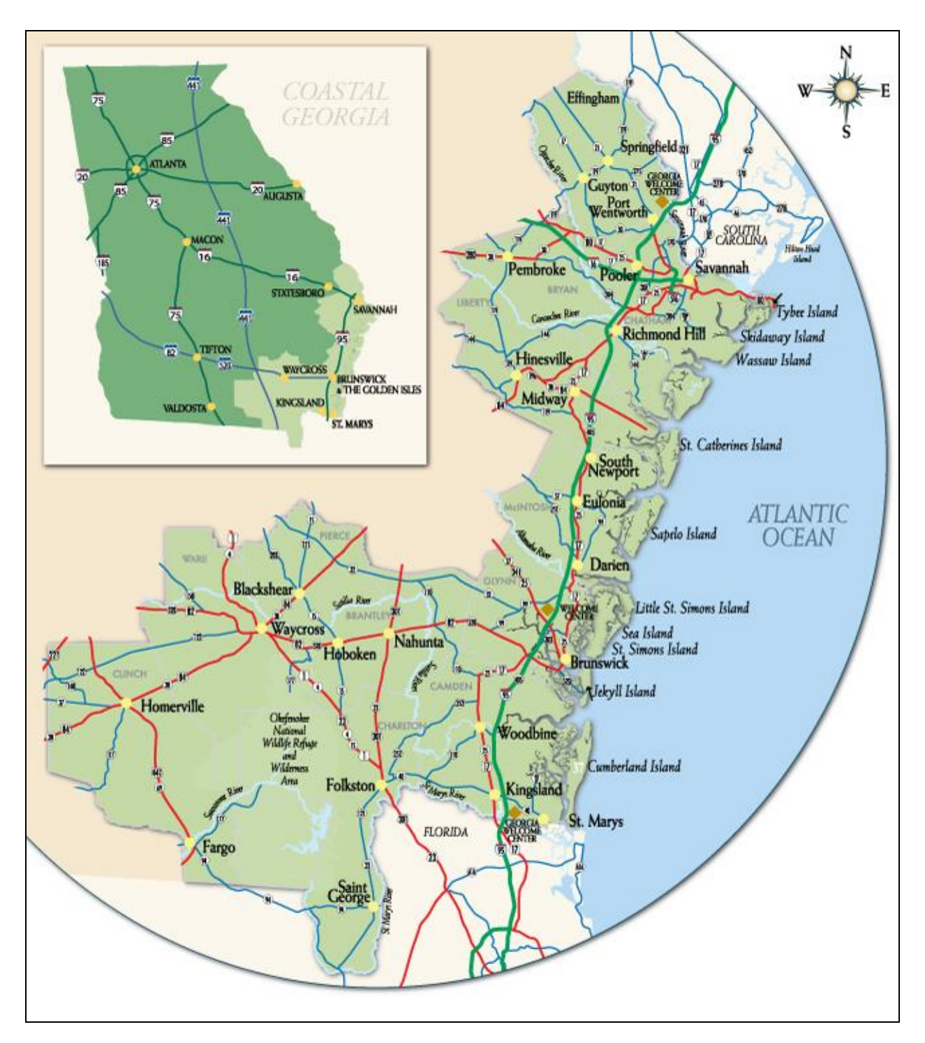
Figure 4. Georgia Shellfish Harvesting Area Map (GCTA, 2015).