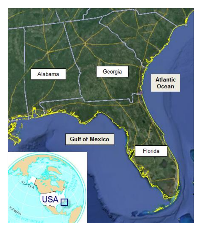
Figure 1. Map of United States showing the states of Alabama, Florida and Georgia and their proximity to the Gulf of Mexico and Atlantic Ocean.