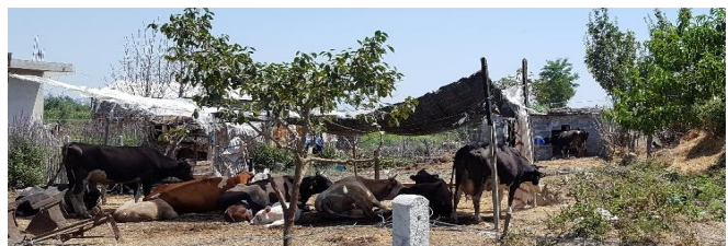
Figure 1. Picture taken on the field: Cows resting in the farm

Although there have been different initiatives from the government and international organisations through projects (e.g. GIZ, FAO, IPARD), the quality of the milk remains a critical issue. The system for the control of milk quality is still weak. Although there have been several controlling restrictions from the government, some of the milk continues to be sold on the road or sold directly by the farmer at home within one day, providing cooling on their refrigerator. Thus, a significant proportion of the